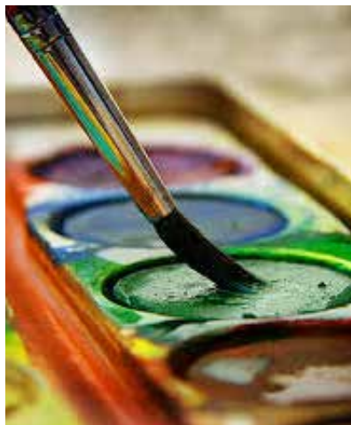
Figure 3: Jo Blog, Paint , photographic print, 297 x 210mm.

Figure number: Artist's name, Title of work (in italics), media, dimensions (height x width x depth) in millimetres.